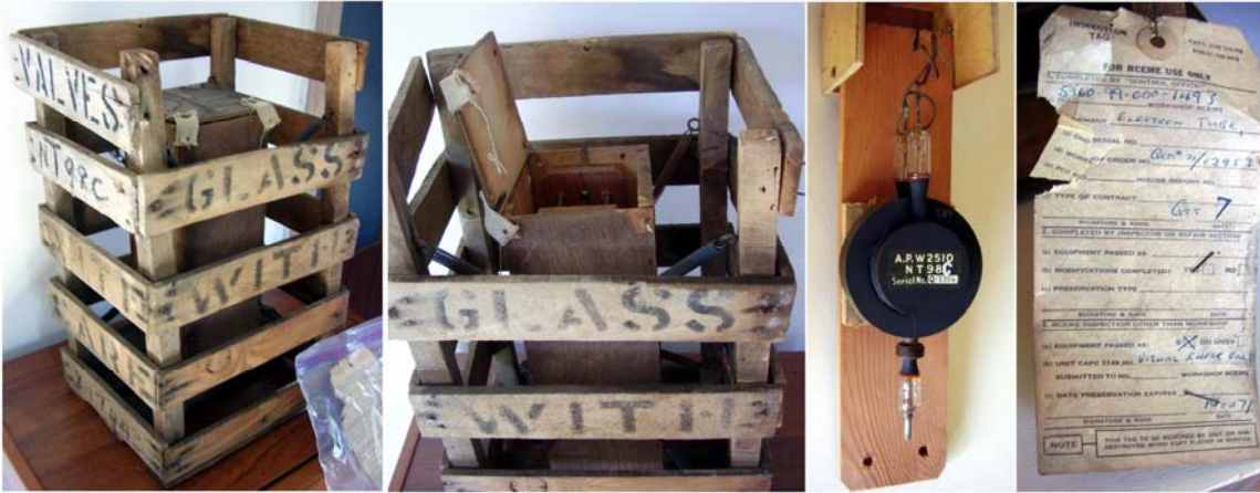
- The original shipping crate with a wooden box suspended inside. The magnetron was secured inside a hinged wooden frame, fastened to the internal wall of the box. On the right, the shipping label dated 1943.