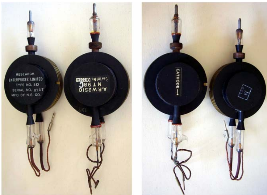
- Side by side views of the British NT98 sample and of a Canadian 3D.

Museum exhibits the very early GEC laboratory prototype of 8-slot E-1189 which was operated by the end of July 1940 plus samples of NT98C, NT98D/CV1255 , CV56 and its frequency variants A , B and C , plus Canadian REL 3C and 3D .