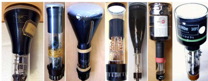
Fig. 10.1 – Some of the CRTs in the collection, starting from WWII. Also included dual-beam, distributed deflection, and memory types.

In the thirties we see the first use of CRT tubes in early experimental television systems. Nevertheless the blast of WWII boosted its use for military in radar systems. The electrostatic deflection was retained only for small screens, up to five inches in diameter, with very limited deflection angles, otherwise the electron beam could interfere with the same deflection plates. Magnetic deflection was preferred to design more compact tubes with larger screens. Depending upon the application we see the same electrode assembly used in similar tubes which just differed from each other for the screen phosphor. Green, medium-persistence phosphor was used in oscillographic tubes, white phosphor was intended for television applications, blue, short or very short persistence types were used in photographic oscillography. A special screen, characterized by medium-short purplish-blue brightness followed by long yellowish-green phosphorescence, was devised for radar applications. The collection includes several CRTs designed for both oscillographic and radar applications, some of them made during WWII.