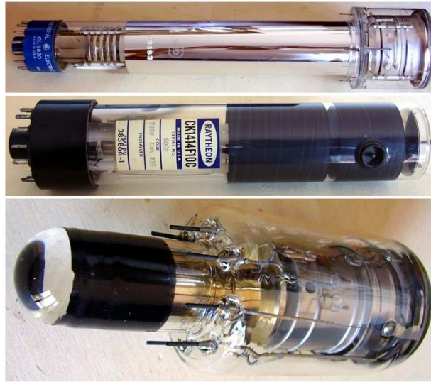
Fig. 10.2 – Some special function or imaging tubes, including an image orthicon, a character generator and an image converter.

This section covers tubes designed to acquire images, converting them in electrical signals, or even tubes capable of converting images caught in a given IR spectrum in visible ones.