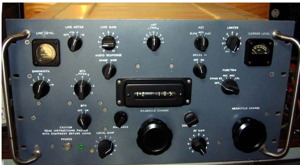
Fig. 1 – The front panel of R-390A, with frequency digital readout.

Both the R-390 and the R-390A were classified equipment until the mid sixties and production of the R-390A ran up to the mid eighties.