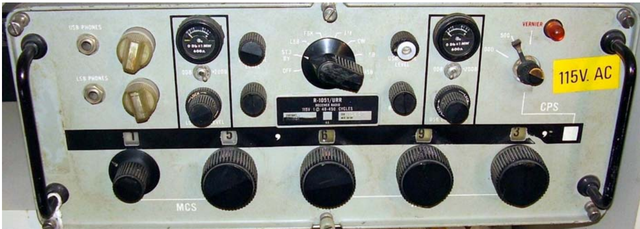
Fig.1 – Front panel of the R-1051/URR receiver

The R-1051/URR is probably the latest communication receiver still using vacuum tubes. Actually it just uses two vacuum tubes in the RF front-end. The receiver is a digitally-tuned triple-conversion superheterodyne, capable of receiving LSB, USB, ISB, FSK, AM, CW and MCW emissions over a range from 2 to 30 MHz. The frequency stability is better than 0.01 ppm per day and the accuracy is better than 0.05 Hz at 5 MHz. First IF tunes from 20 to 30 MHz, second IF is 2.85 MHz, third IF is 500 kHz.