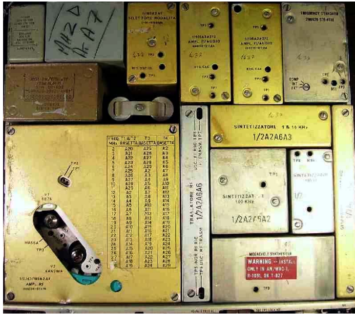
Fig. 2 – Internal view of the top side, showing the plug-in modules. Power supply, two audio amplifiers and the internal crystal controlled reference are visible in the top row. The RF amplifier, with the rotating tuning turrets, and the frequency synthesizer unit, with six sub-units, are in the bottom row.