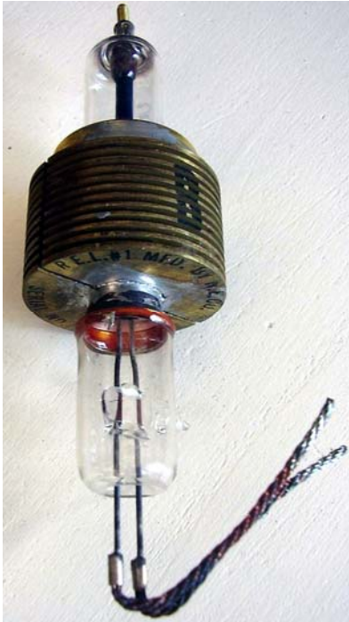
- This sample, made by Northern Electric for Canadian REL, carries the codings REL #1, V.T.90 and 10E/97B. Click to enlarge.