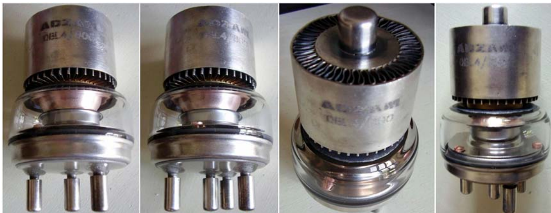
Photos of the European QBL4/800 equivalent.