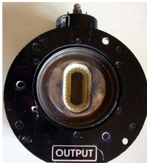
Fig. 1.5 - The V261C/1M was a H-wave microwave oscillator designed to operate around 6 GHz.

In the fifties STC also introduced a line of oscillators derived from the Heil tubes, but using a waveguide section in place of the drift electrode. These devices, also known as H-wave oscillators, were proposed mainly for microwave communication relays.