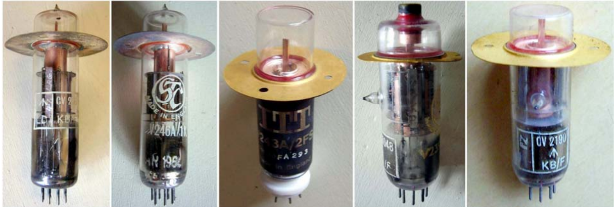
Fig. 1.4 - Some samples of British Heil oscillators. From left, CV228 and its alternate selection CV485 , CV5463 . The last two photos are of CV5048 and CV2190 .

British STC produced some Heil tubes both for military applications and for microwave communication relays, well in the late fifties. Some Heil tubes were also built in Germany, where Oskar Heil moved at outbreak of WWII.