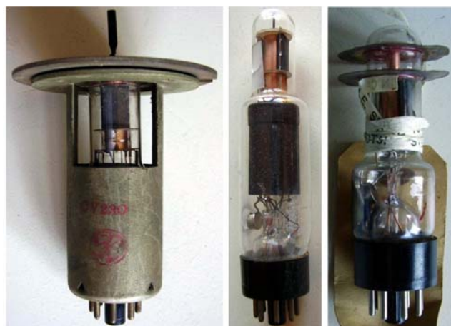
Fig. 1.3 - Some rare samples of Heil oscillators presumably made around 1940 or 1941. From left, the CV230 looks to be designed to fit in the external wall of a waveguide. The DV27 in the middle was an oscillator operating at 10 cm. The DV57 on the right is given on the label as a frequency variant of a DV55, designed to operate at 3 cm.

Heil tubes could be AM modulated applying modulation signal either to G1 or to the screen grid. FM modulation was also possible, applying the signal to the resonator. Efficiency was poor, in the order of 10 % and probably this was the reason why Heil tubes became soon outdated in favor of the most versatile klystrons. Anyway Heil oscillators were investigated during the war as possible microwave sources in radar applications. The collection includes very rare and undocumented samples of early devices designed to operate even at 10 and 3 cm wavelength.